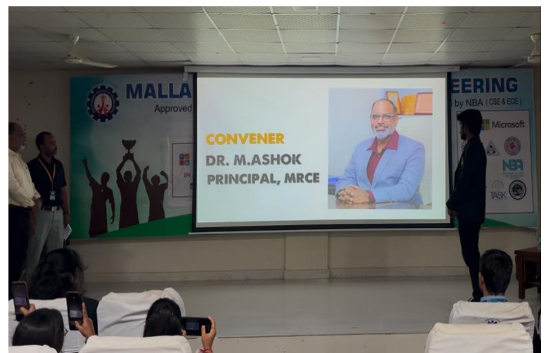
Inaugurated the MLSA x MRCE Chapter and unveiled its logo By Principal Sir