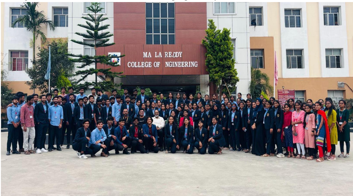
The event concluded with a group picture.